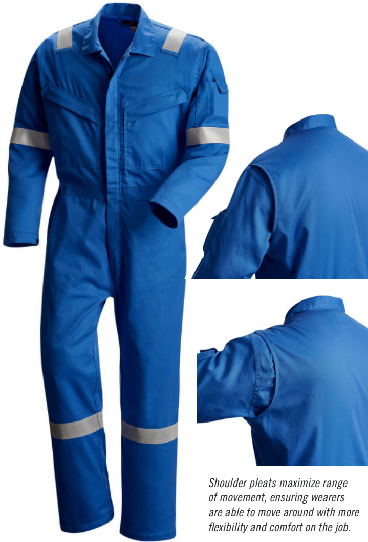
Shoulder pleats maximize range of movement, ensuring wearers are able to move around with more flexibility and comfort on the job.