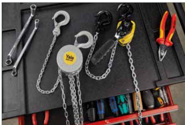
Fits in every tool box