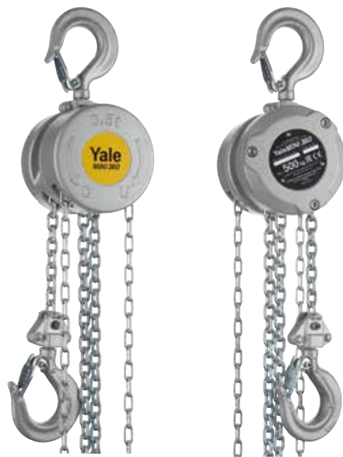
Capacity 500 kg