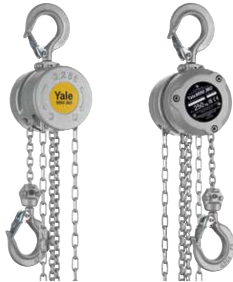
Capacity 250 kg